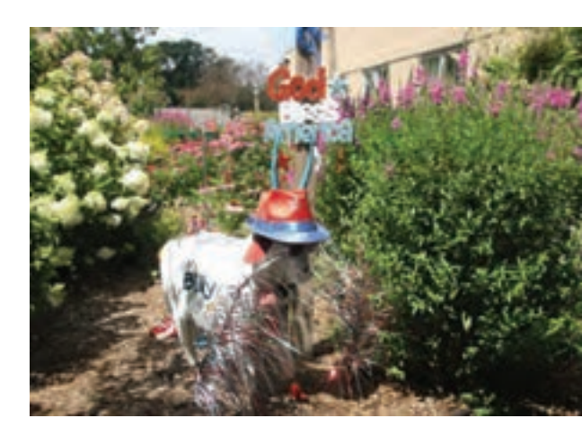
Billy, the garden mascot, is decorated for the Fourth of July.