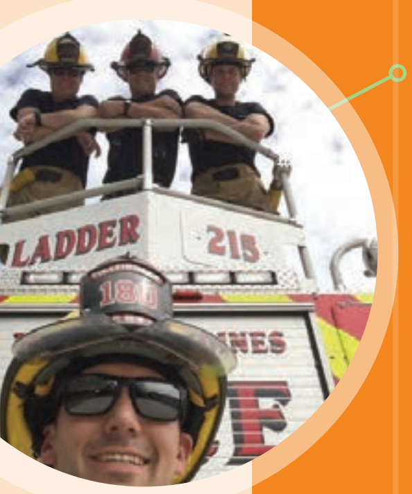
▲West Des Moines Fire Department