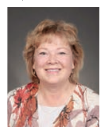
"There is an amazing level of thoughtful care here the passion of the staff is inspiring."

An immediate goal is to see the current landscaping plans take physical shape for a 1.5 acre one-of-a-kind therapeutic grounds project on the Ankeny campus. My long-term goals are to support the continued growth of all programs in Ankeny and Glenwood, as well as support the On With Life Foundation. It's an exciting time to be a part of such an amazing organization!